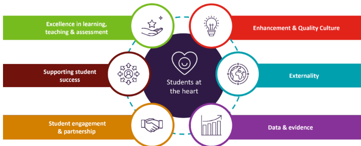
Fig 1: Principles of Scotland's Tertiary Quality Enhancement Framework (TQEF)

At the core of these shared principles is the desire to deliver better outcomes for our students, and to place them at the heart of the framework.